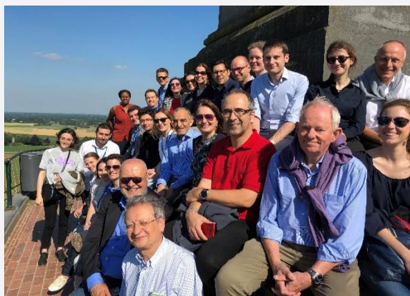
ESPA participants and invited speakers at the top of the Lion's Mound

From above, participants and invited speakers alike could contemplate the breath-taking battlefield spreading far and wide to the horizon.