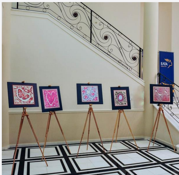
The histological images that were depicted on stamps

gained attention, I got to display my art collection at the 82 nd Thessaloniki International Fair, in September 2017.