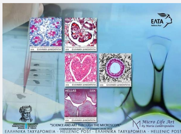
Commemorative set of stamps, 1st Day of Issue 19.03.2018.